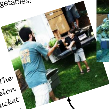
The watermelon bucket brigade!

Check-in Charlies - Check-In Charlies help check in shareholders picking up their share for that week. They also complete transactions for SNAP and future orders, handle money, and write receipts. This will require some training, which you'll find in the pages ahead.