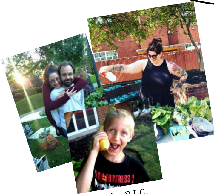
The P.I.C! (People in Charge)

Show Running - Show Running is our fancy name for the Volunteer Lead. We are always looking for volunteers interested in taking charge at our Fresh Stop locations. If you think this is you, you'll need to be prepared to manage cash out at the end of the evening, coordinate orders, communicate stop needs to the City Fresh Program Coordinator, and help retain enough volunteers for the stop location. This will require additional training.